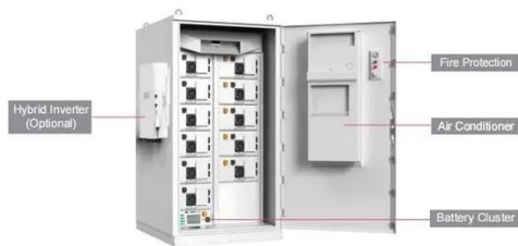
Image: R.Power. Developer and IPP R.Power has ...